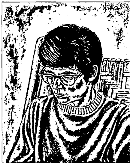
Oil on panel, 24 x 30 in.